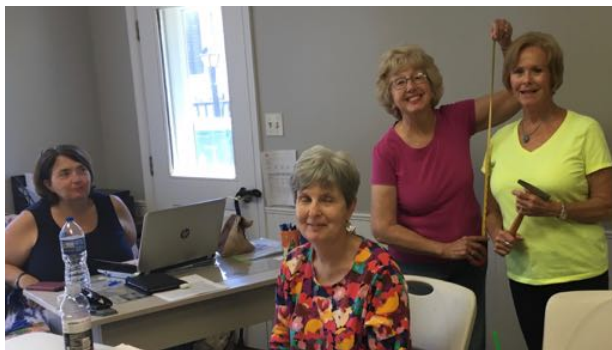
MAG's Exhibit Crew: (Left to Right)

At the next members meeting we plan to have a presentation on Framing so please have your questions ready. You may also check on-line for framing tutorials.